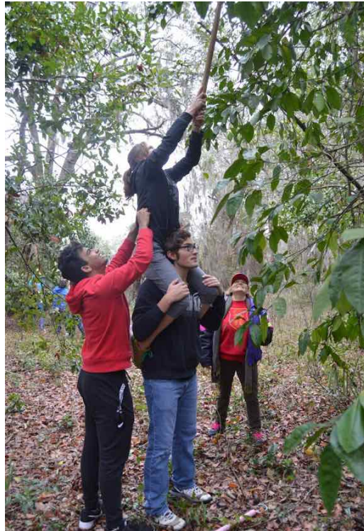
Fruit Tree Gleaning